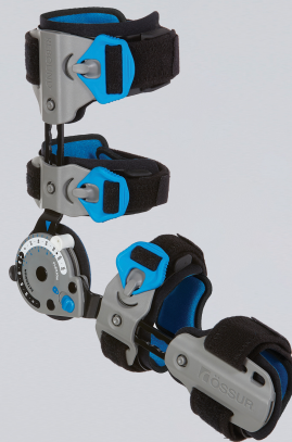
Rebound® Post-Op Elbow