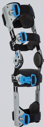
Rebound® Post-Op Knee