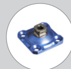
4 - HOLE MALE PYRAMID