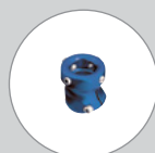
FEMALE TUBE CLAMP