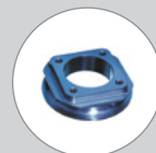
4-HOLE SOCKET ADAPTER