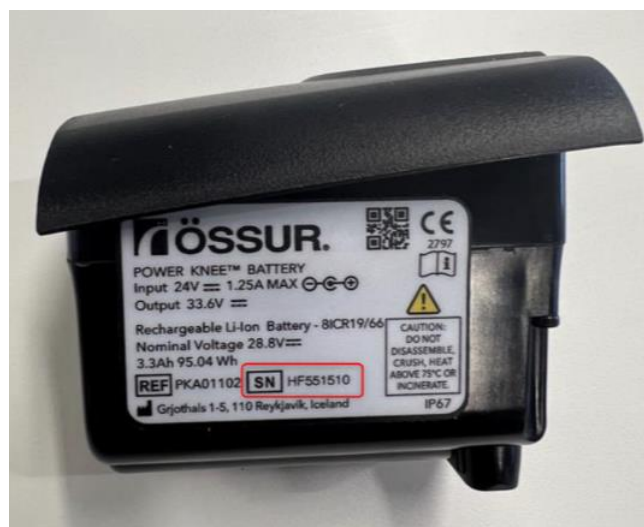
Battery Serial Number (RED)