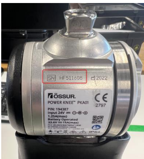
Power Knee Serial Number (RED)

Match the Power Knee serial number in this letter with your records. Retrieve the knee and ensure the serial number of the knee matches. Remove the battery and match serial number found on the side of the battery with the affected battery serial number in this letter.