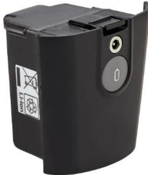
Power Knee Battery