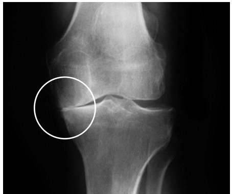
Medial compartment OA of the left knee

narrowed and the bones are rubbing together. Your doctor may refer to this as “bone-on-bone” contact.