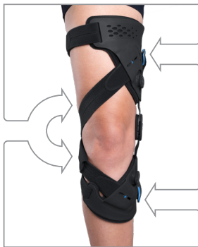
The 3-Point Leverage System (Unloader One® X shown)