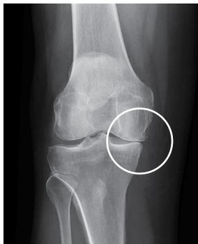
Knee OA without bracing (bone-on-bone contact)

The biomechanical change in the knee is demonstrated by the x-rays below.