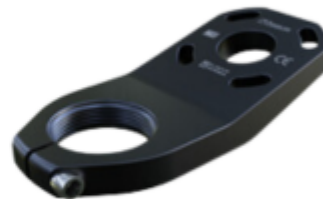
70mm offset 15° flexion