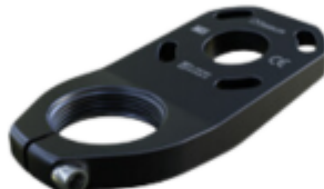
60mm offset 10° flexion