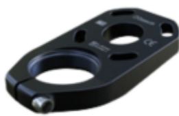
45mm offset 10° flexion