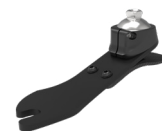
Scout (College Park Industries)