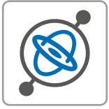
Intelligent Motion Gesture Control

i-Digits is a multi-articulating powered partial hand prosthesis.