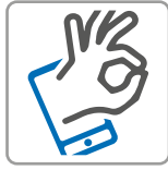
Quick Grips® App Control