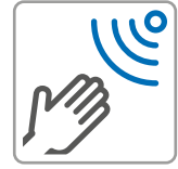
Grip Chips® Proximity Control