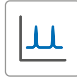
Triggers Muscle Control